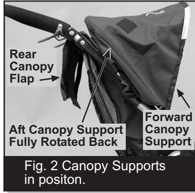
Fig. 2 Canopy Supports in position.